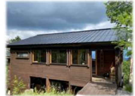
Roof integrated solar panel