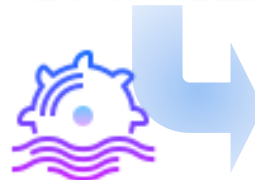
A small hydro power plant to be installed