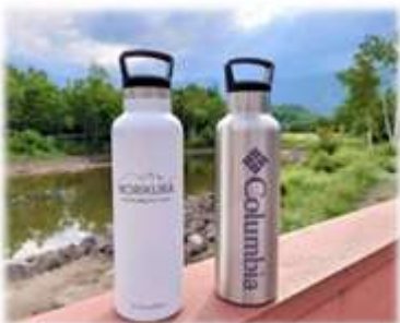
Let us use my bottle for decarbonisation