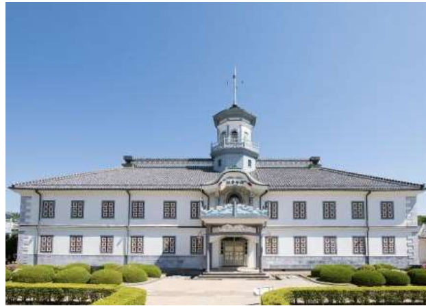
Kaichi School, NT