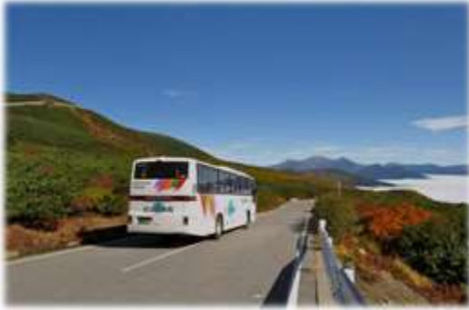
Can not use their own car in the area