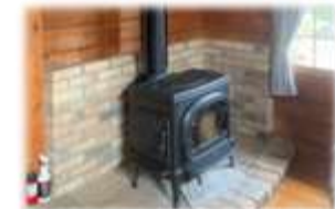
Wood stove using local timber