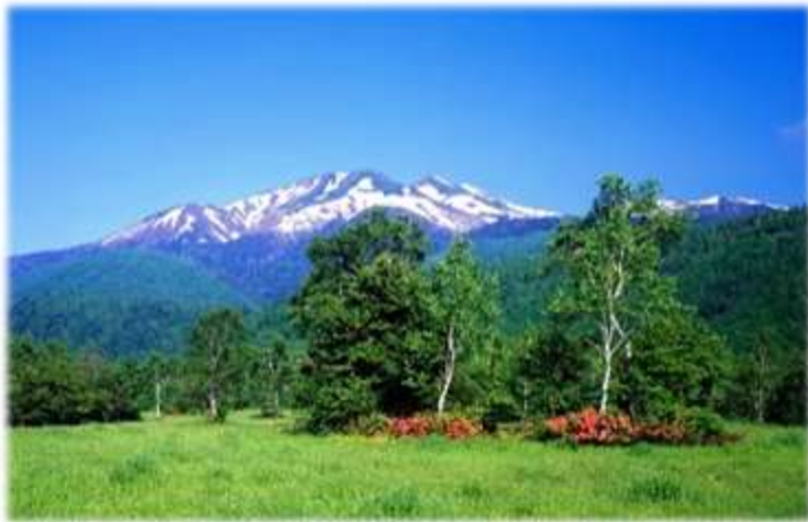
The local community maintains grasslands

The regional vision was developed with the initiative of its local residents