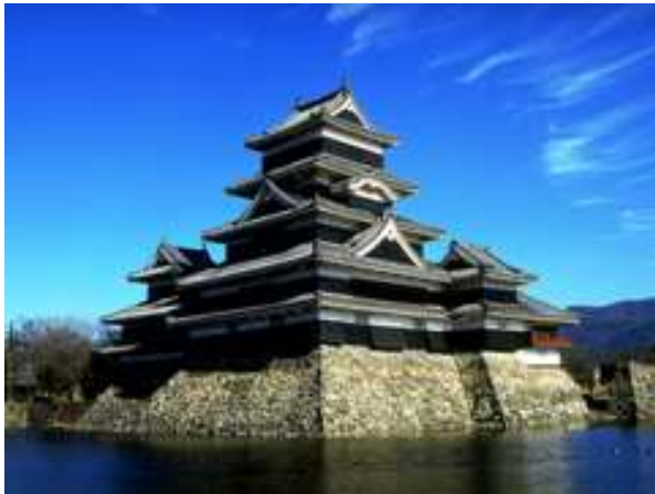
Matsumoto Castle, NT

Approximately 9,000 UK residents come to Matsumoto every year.