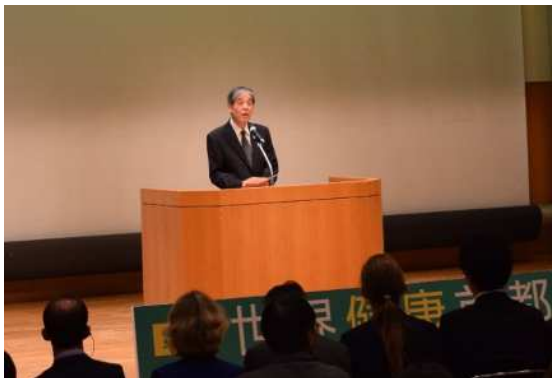
Greeting from conductor

Section Sub-Manager, Ministry of Health, Labor and Welfare Department of Health Section